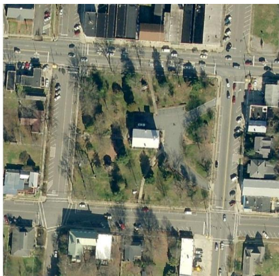
Aerial view of Dallas Town Center

The historic assets of Dallas Town Center exist as its most important strength upon which to rebuild business in the Town Center; provide physical heritage as a framework for enhancing Town Center design; promote Dallas Town Center for enhanced human activity, visitation, events and attractions; and, to garner community support for Town Center physical and economic development.