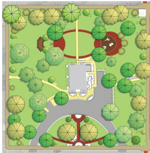
Generalized depiction of renovated historic courthouse grounds. Based on landscaping plan prepared by Site Solutions, PA.

3.2.. The historic courthouse grounds, which serves as a “town commons” will also be receiving a landscaping makeover as part of the courthouse renovation.