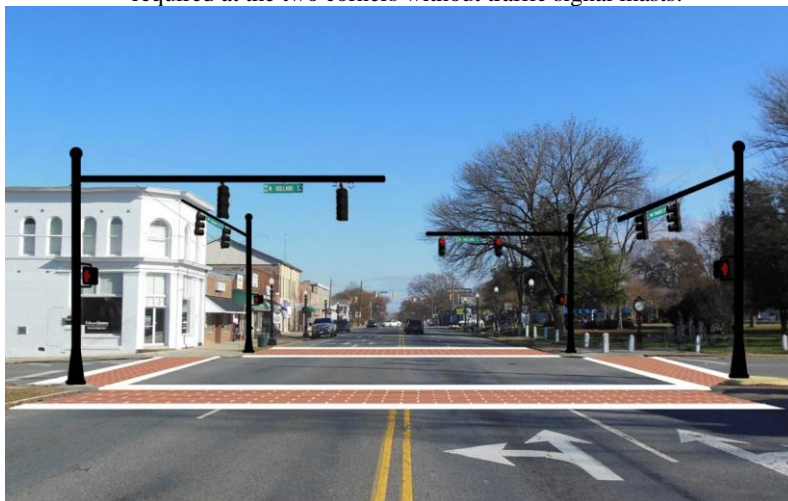
Illustration showing new signal poles and mast arms, and brick-pattern crosswalks. Note: black signal housings are used.

3.4.1. Install new signals, poles and mast arms at intersections of Trade and N. Gaston, and W. Trade and N. Holland. The illustration below shows four one-arm signal poles. Alternatively, the Town could install two, two-arm signal poles at the appropriate caddy-cornered positions. NCDOT may require one configuration or the other. If the two-pole configuration is chosen, decorative pedestrian signal poles (about $400 apiece) will be required at the two corners without traffic signal masts.