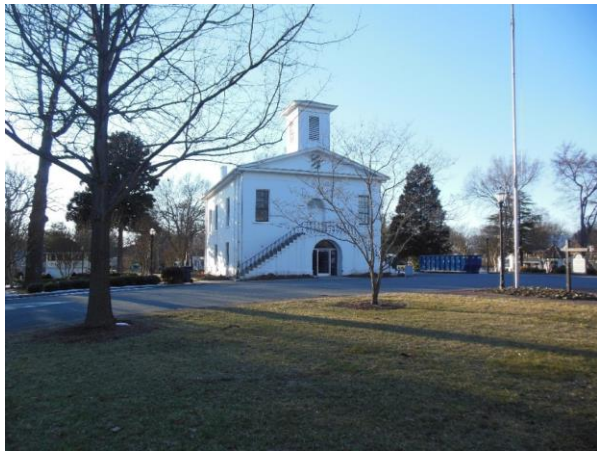
The 1847 Greek Revival courthouse pictured as renovation and restoration work begin.

3.1. The historic former Gaston County Courthouse is being restored and renovated as the Historic Dallas Courthouse Center, an events venue. The 1847 courthouse and square are property of the Town and served as Dallas Town Hall for many decades. This $850,000 project will be completed in the latter half of 2014.